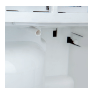
Continuous water drainage device.