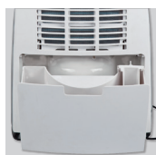
Removable water tank.