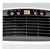
Control panel Humidity indicator display.