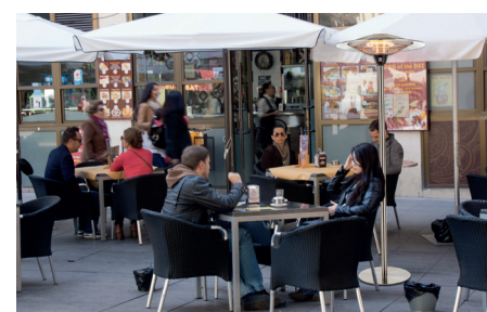
Bar and restaurant terraces.